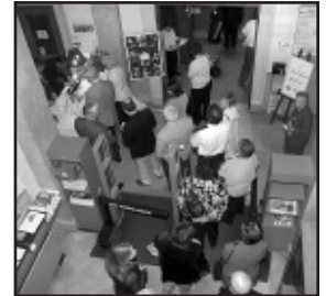
Various people attending the 4th Annual Fundraiser

The Manchester City Library Foundation extends its thanks to our Corporate Sponsors: Sovereign Bank, Citizens Bank, Naults Powerhouse and TD Banknorth, N.A. and the following restaurants/establishments for donating their delicious food, beverages, flowers, products and services.