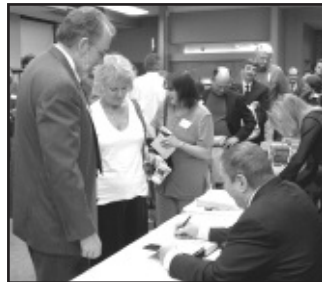
Our guest of honor signing books for our donors.