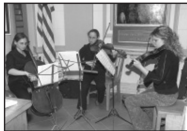
Entertainment provided by Manchester Comm. Music School