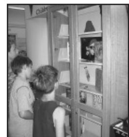
Some of the things that were funded in 2006!