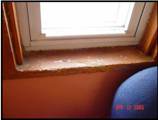
Window sill with lead paint

There are laws to protect people from lead poisoning. For more information, call: